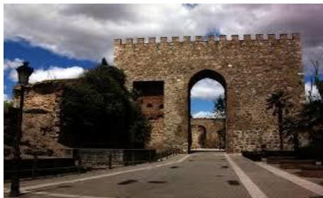
TALAVERA DE LA REINA