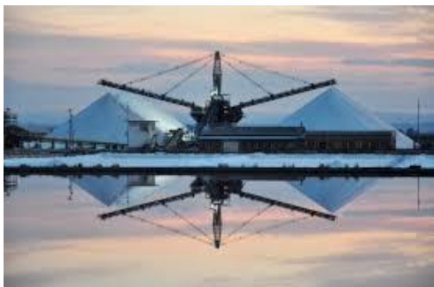
MARGHERITA DI SAVOIA